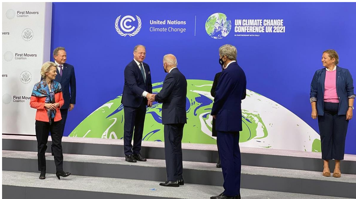
Martin Lundstedt, CEO and President of Volvo Group, shakes hands with U.S. President Joe Biden at COP26.

Rokbak welcomed Martin Lundstedt, CEO and President, Volvo Group, to our world-renowned factory and HQ in Motherwell, Scotland.